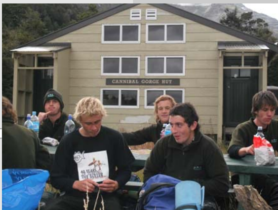
Day 1: Lunch 3pm—Cannibal Gorge Hut. Six hours of tramping lay ahead before the day was to be complete.