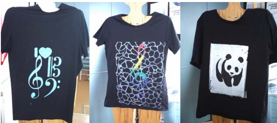
These are some examples of the fantastic T-shirts that the Year 10 students have printed and sewn fthis term in Fabric Technology.

This year 30 students participated in the Gateway Programme. Some of the career paths investigated were Vet Nursing, Childcare, Building, Mechanics, Graphic Artists, Photography, Chef, Teaching, Broadcasting, Farming, Pharmacy, Hairdressing and the Beauty Industry. All students achieved the minimum requirement of ten credits for the year with some excelling well beyond the requirement.